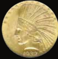
$10 Indian Eagle (1907 - 1933)