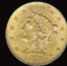
$2.5 Liberty Quarter-Eagle (1840 - 1907)