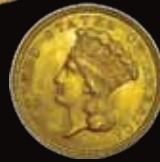
$3 Indian Princess (1854 - 1889)