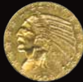
$5 Indian Half-Eagle (1908 - 1929)