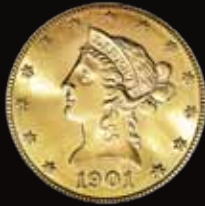
$10 Liberty Eagle (1838 - 1907)