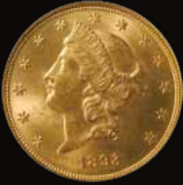
$20 Liberty Double-Eagle (1849 - 1907)