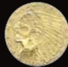
$2.5 Indian Quarter-Eagle (1908 - 1929)