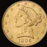
$5 Liberty Half-Eagle (1839 - 1908)